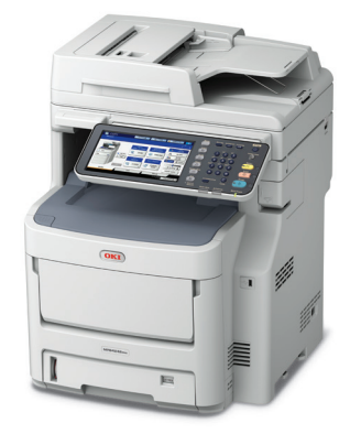
MPS4242mc – Up to 42 ppm Color/ Mono<sup>1</sup>; 630-sheet standard paper capacity, upgradable to 3,160 sheets; 20-sheet convenience stapler