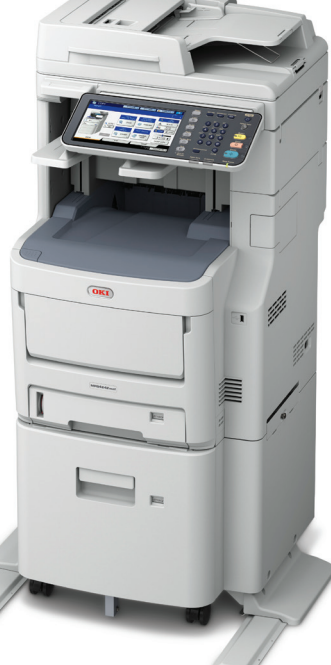
MPS4242mcfx – Up to 42 ppm Color/Mono<sup>1</sup>; 2,630-sheet standard paper capacity, upgradable to 3,160 sheets; 50-sheet in-line stapler