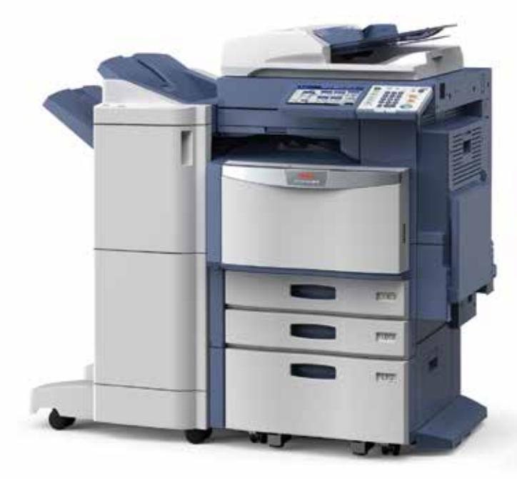
CX4545x MFP with Large Capacity Feeder; holds up to 3,700 sheets (shown with optional Multi-Position Finisher)