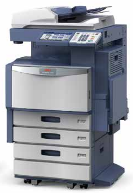
CX3535t MFP with 550-sheet Paper Feed Pedestal: holds up to 1.750 letter- or tabloid-size sheets