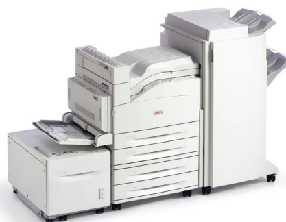
B930dn shown with optional 1,000-sheet Tabloid/A3 tray, 2,000-sheet High-Capacity Feeder, and Stacker/Finisher