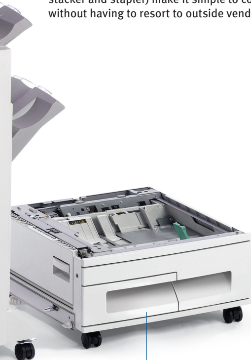
Optional 2,000-sheet Letter/A4 Tandem Tray

Quality, performance, efficiency and support: proof that the B930 Series from OKI is the answer to your high-productivity network printing needs.